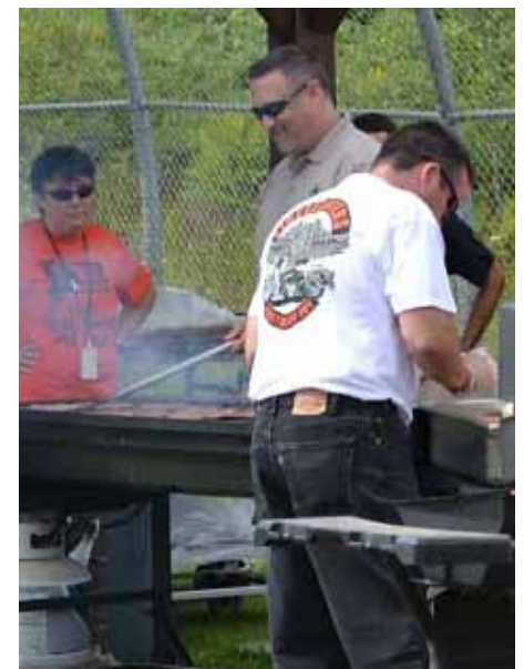
Summer means barbecue!